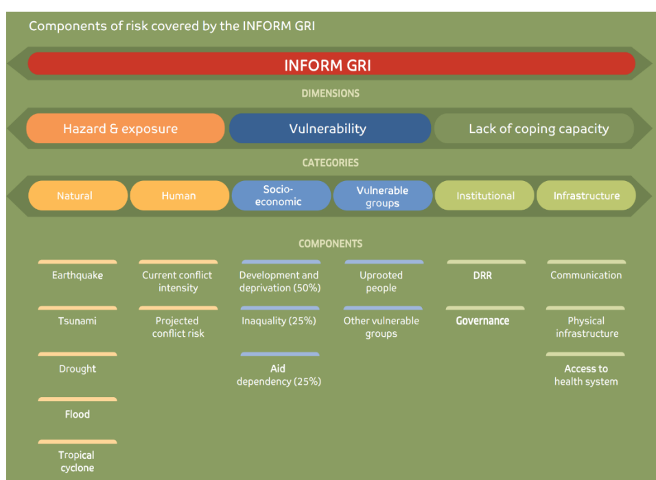
Figure 2: INFORM Risk Index (European Commission 2019)

The latest available iteration of the index, from 2019, covers 191 countries. The country, where We Effect works that scores the highest in terms of risk of disasters or crises is Uganda (6,3), coming in as the 17 th most at risk country in the world. Furthermore, the countries that scores the highest in We Effect’s working regions are Guatemala (5,5), the Philippines (5,5) and Bosnia and Herzegovina (3,7) (INFORM, 2019).